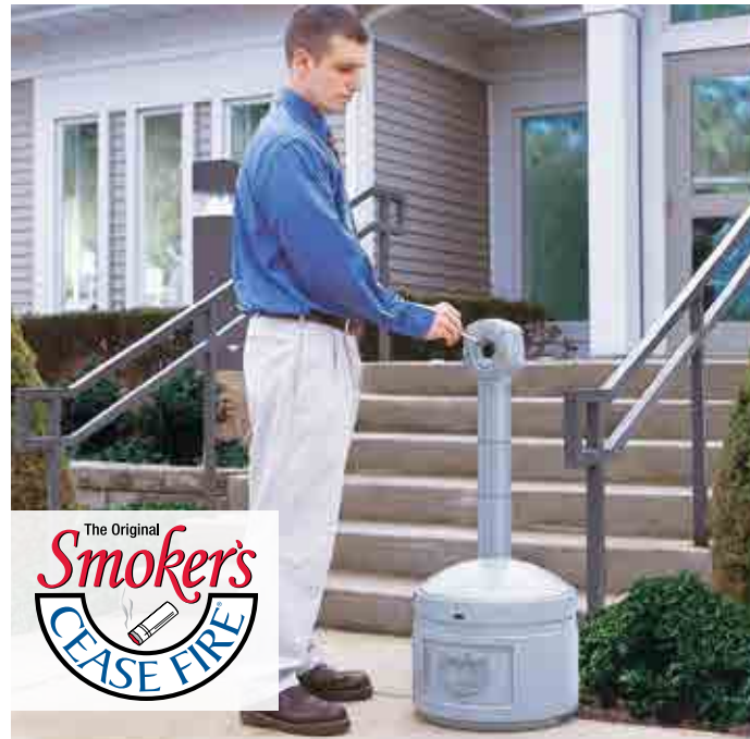
Ideal for any establishment—clean grounds help maintain your business image.

Large covered head dissipates heat and keeps rain out